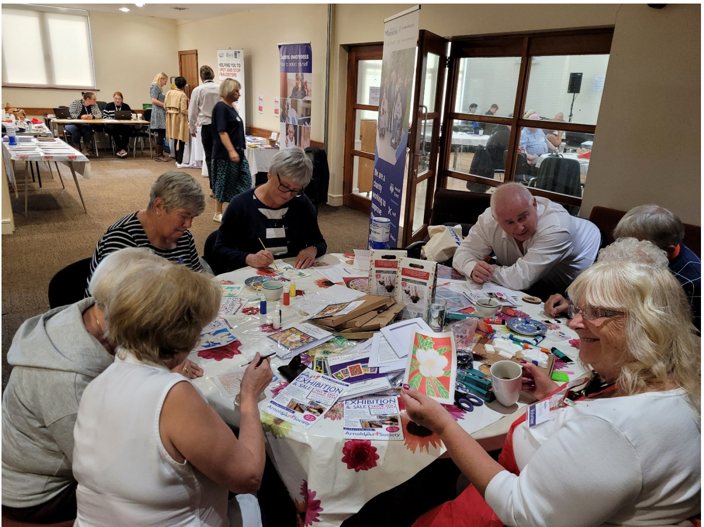
Figure 2 Memory Cafes and groups provide stimulation and support for everyone affected by dementia

Lastly, don't overlook the option of respite care . This provides a short break for the person with dementia, either at home or in a care setting, while you take some time for yourself. Respite care can be invaluable in allowing caregivers to recharge and focus on their own wellbeing.