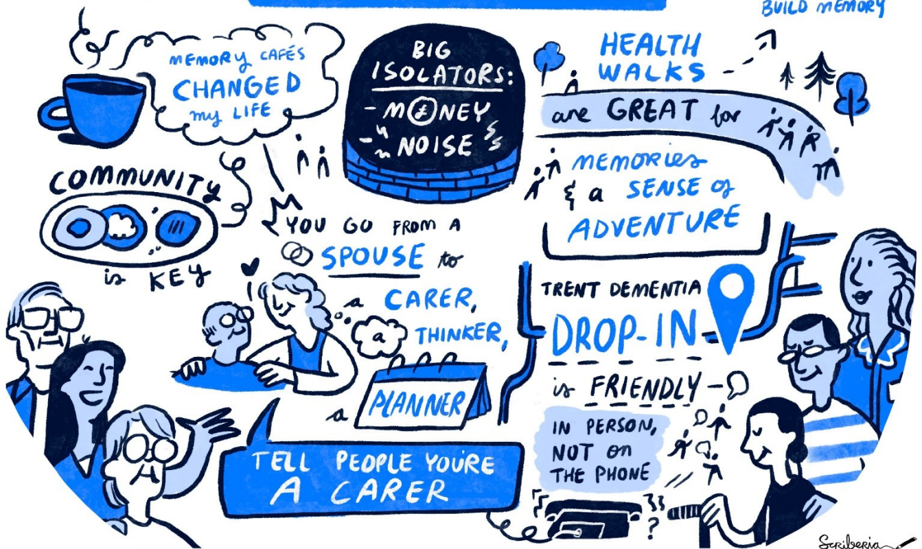
Figure 1@scriberian drawing containing quotes from people attending Trent Dementia's activities

WALKING 5 MILES A MONTH HELPS BUILD MEMORY